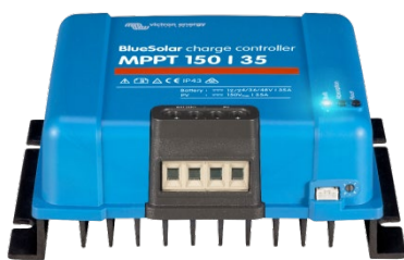
Solar Charge Controller MPPT 150/35